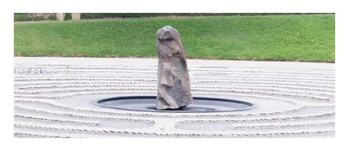
Figure 1: "The Eye that Cries", Campo de Marte, Lima, Perú.

"The Eye that Cries" is a particularly meaningful monument for Peruvians. It was built in Lima in 2005, thanks to the initiative of Peruvian civil society groups, with the aim of paying tribute to and preserving the memory of all victims, as well as to educate about recent Peruvian history. A trickle of water runs incessantly from a large, granite boulder at the centre of the memorial, which is surrounded by a labyrinthe of concentric circles made of thirty-two thousand little stones, on which the names of some of the victims are engraved. The memorial represents Pachamama, the Andean Mother Earth, who cries for her children. The memorial represents Pachamama,