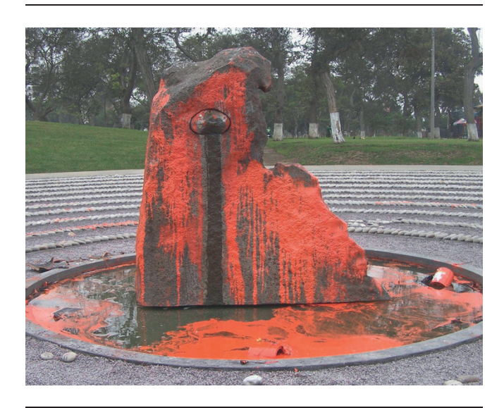
Figure 2: "The Eye that Cries" memorial following vandalisation on 23 September 2007.

reconstruction in the aftermath of traumatic events, was broken, because of the interference of an external actor. This legal construction of memory, decided from above, is viewed as an external imposition and an outside element that can play no role in the social dynamics of making sense of past atrocities. From a symbol of unity and solidarity for all victims, "The Eye that Cries" became a site of contestation and division. <sup>36</sup>