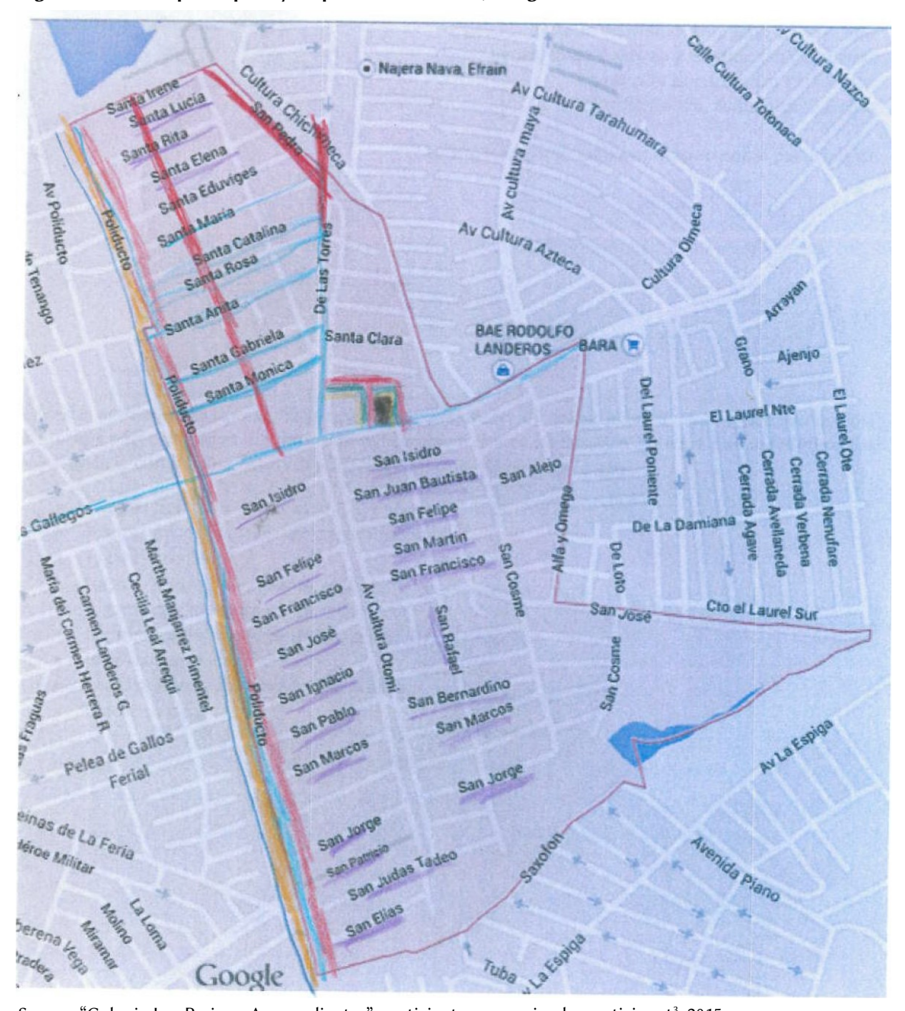
Figure 1: Clarisa's participatory map from Los Pericos, in Aguascalientes