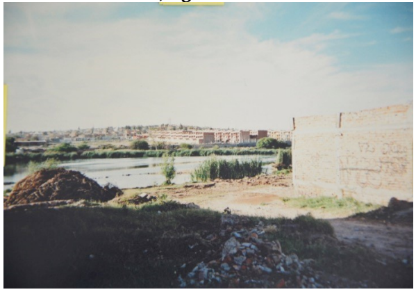
Figure 6: Place considered "insecure", La Laguna area in Los Pericos, Aguascalientes