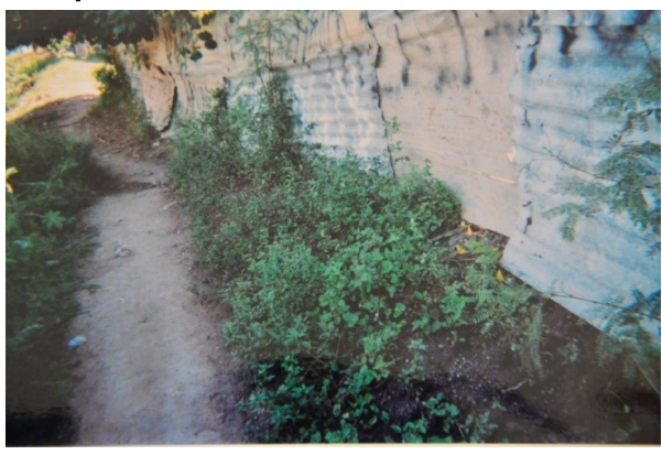
Figure 7: Place considered "insecure", a makeshift path in 5 de Febrero, Culiacan