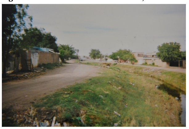
Figure 10: Place considered "insecure", river bed