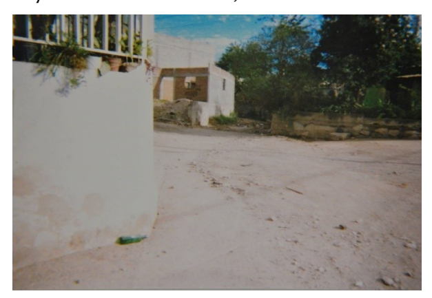
Figure 8: Place considered "insecure", a community corner in 5 de Febrero, Culiacan