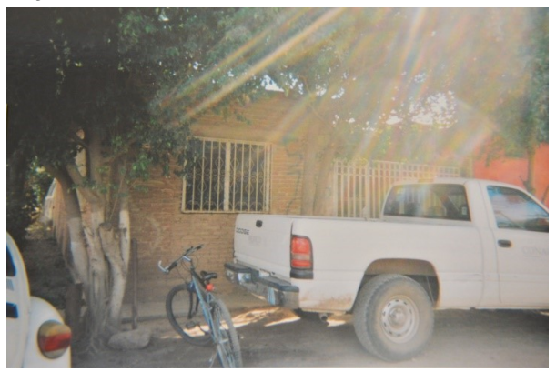
Figure 12: Place considered "secure", front porch of Jose's house