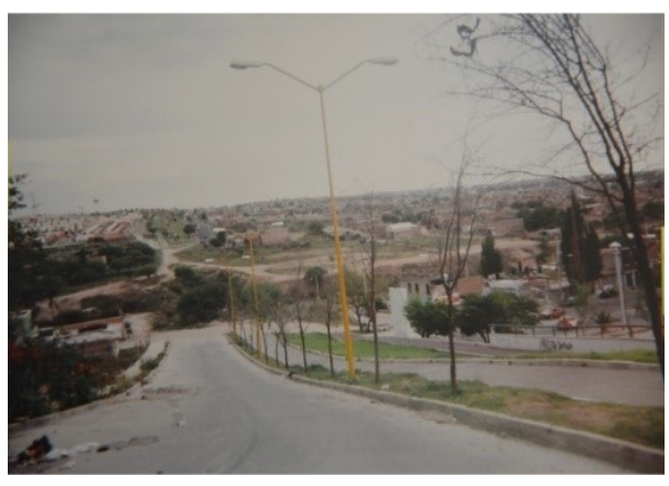
Figure 5: Place considered "insecure", end of Linea Verde