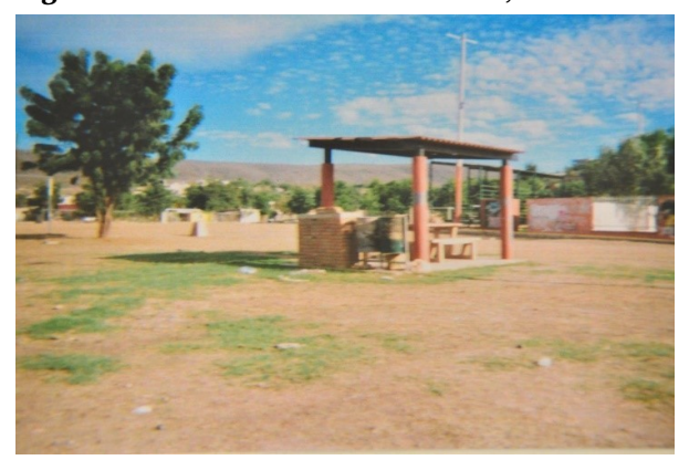
Figure 9: Place considered "insecure", las canchas