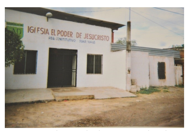
Figure 11: Place considered "secure", local church