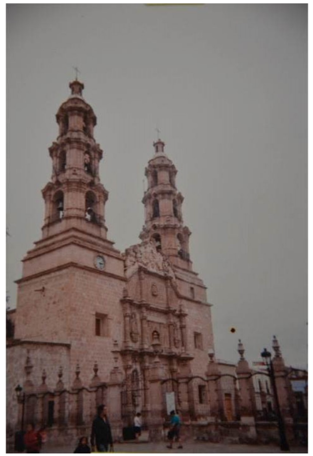
Figure 4: Place considered "secure", a local church