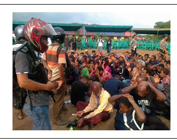
Figure 4: Indonesian security forces dismiss the Third Papuan Congress, 2011

This pattern of violence and torture as normality has persisted until this decade. The image in Figure 4 shows the Indonesian state and security authorities forcefully dismissing a major gathering of Papuans during the "Third Papuan Congress of 2011". This public event brought together some two thousand Papuans on the soccer field of the Catholic School of Theology "Fajar Timur" in Abepura (PGGP and Elsham Papua 2011). This was a prominent event organized by the Papuan leadership, and it was broadly covered by local and national media (PGGP and Elsham Papua 2011). The main agenda of the Congress was the election of a new Papuan nationalist leader, which was thwarted by the raids of the joint police and military forces who completely brought the process to a halt.