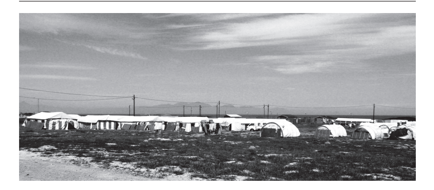
Figure 3: The Blue Water safety site

3. "Protecting the Most Vulnerable": The Limits of Statecraft and Citizenship A few days before the official closure of the Blue Water safety site at the end of November 2008, a strategic planner from the reintegration team of the Department of the Premier visited it. He insisted that the site had to close, and that in any case foreigners were not to live separately from South Africans, as this was the official line of the provincial government. The planner, a long-time comrade (former ANC activist), well versed in conflict resolution and security issues, felt sorry and upset at the same time. He appeared to understand the plight of the displaced, but considered that the state had done its job by offering six months of social relief, and that from now on, the nearly five hundred remaining displaced persons would have to reintegrate into communities by themselves, before the police evicted them for unlawful use of public space. In a last gesture of compassion, he asked the volunteers, who were still distributing food on a daily basis, to compile a list of the twenty or so "most vulnerable" persons (pregnant women, sick and old persons, etc.) whom the government would take responsibility for, while the others would be required to vacate the site before an official evacuation order would be given. The volunteers refused and said they